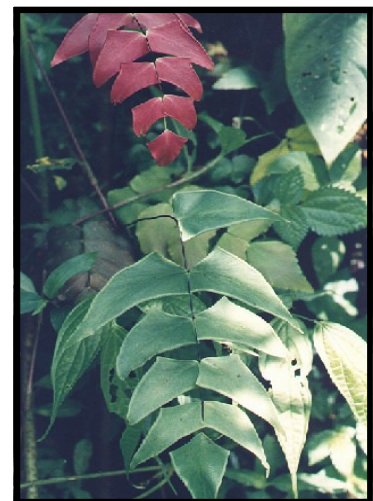
Adiantum macrophyllum, showing juvenile red growth and mature green foliage

Along with the 200 species of Adiantum , there are myriad cultivars and hybrids out there as well. Most people tend to associate maidenhairs with 'baby's breath' flowers. There is not a great similarity other than the fact that some maidenhair leaflets are tiny, and in some way can resemble 'baby's breath' flowers. However, some of them, for example Adiantum peruvianum , or A. macrophyllum , or even A. trapeziforme , have rather large leaves or pinnules.